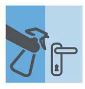
CLEAN AND DISINFECT "HIGH-TOUCH" SURFACES OFTEN