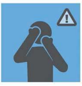
AVOID TOUCHING YOUR EYES, NOSE, OR MOUTH WITH UNWASHED HANDS OR AFTER TOUCHING SURFACES