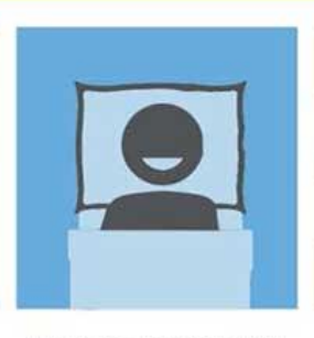
GET ADEQUATE SLEEP AND EAT WELL-BALANCED MEALS