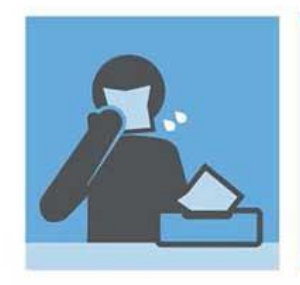
COVER YOUR MOUTH WITH A TISSUE OR SLEEVE WHEN COUGHING OR SNEEZING